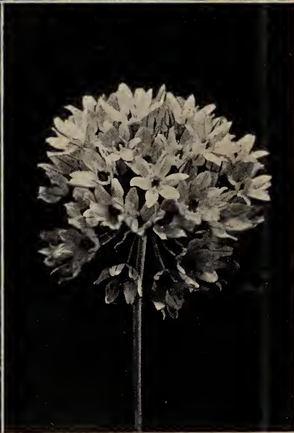
Allium Cernuum (see Page 3) Brodiaea Bridgesii